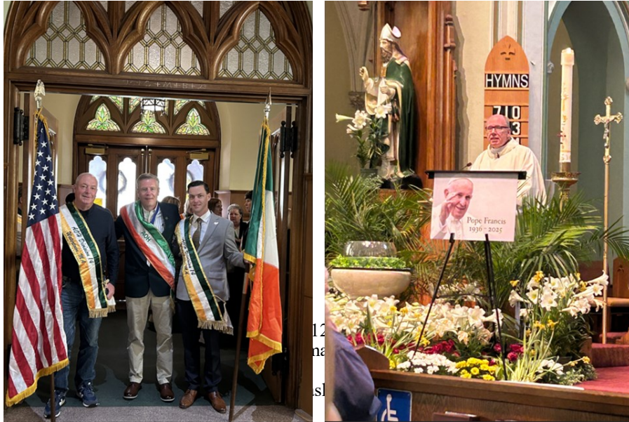
27-April Mass at St. Patrick Church. The Division 14 AOH and LAOH members marched into St. Patrick's Church to commemorate the members who have passed since our last Communion breakfast.