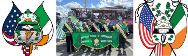
LAOH & AOH members at the 2024 Boston St. Patrick's Day Parade

Members of the AOH & LAOH will march again in the annual Boston St. Patrick's Day Parade on Sunday, March 16 th . For those able to make the three-mile walk, it could be a great way to show off your colors.