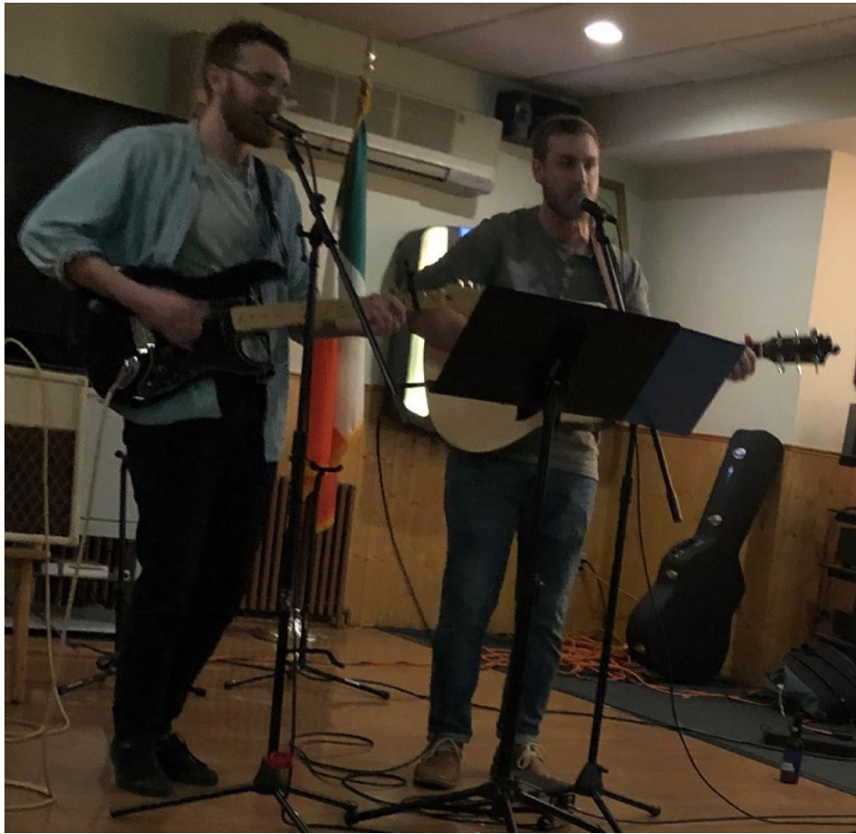
Entertainment in the lounge this past November